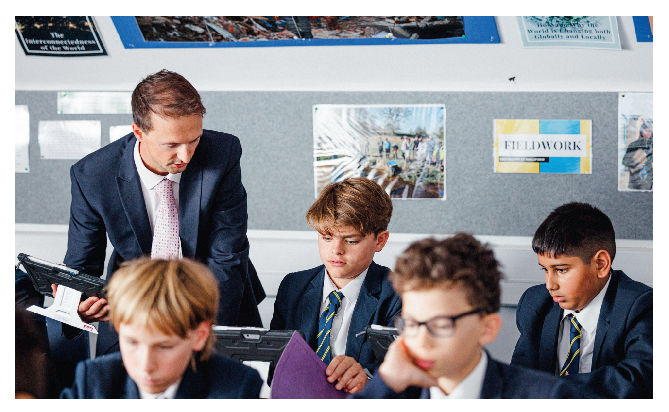
Come as you are. Go as all you can be.