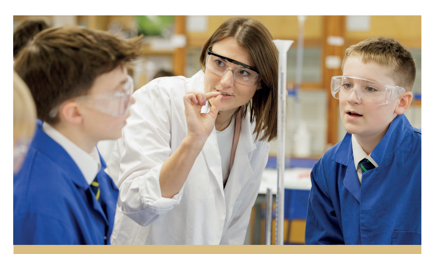
"The ISQAM was great to do as it prepared me for becoming a Head of Department. Although I knew what Heads of Department did, it helped me better understand the management and leadership behind the 'day-to day'.

"Congratulations on an outstanding portfolio submission. It was truly outstanding and one of only a few that were flagged in this way." - HMC